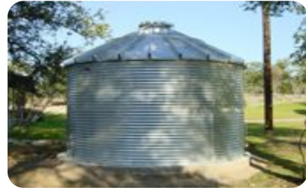
CHR- High-Rib Roof