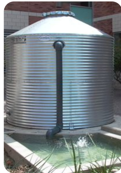
FS - Flat Seam Roof