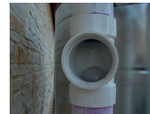
Ball Valve Tee

Filter, mosquitoes and other insects can enter your cistern via the constant volume first flush device. GutterFilter provides the best gutter protection and prevents any mosquitoes from entering the cistern via the gutter and downspout. During a really long and slow rain, the rain will not wash the roof and the debris and sediment will remain on the roof and the constant volume first flush device will engage and send the roof water to the tank. And if the rain picks up, all of the debris on the roof will be sent to the cistern as the containment chamber is full from the drizzle..