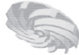
Updated Vortex impeller for superior performance