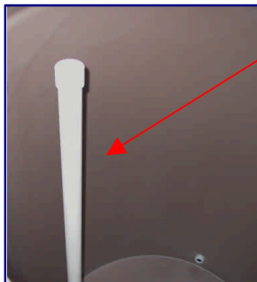
Primary overflow inside that drains to hidden overflow outside

washing vehicles. The standard model has a zinc garden drain valve. Both models include an internal overflow tube that drains to the bottom of the barrel. A secondary overflow is optional