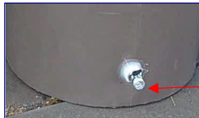
Deluxe model butterfly drain valve

used to water indoor and hanging plants and can also be used for