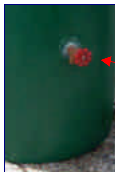
Deluxe model garden spigot with garden hose threads

small animals. The RB80g is available with an optional strainer basket. An added feature of the Deluxe model rain barrel is that it will collect and store rain and melted snow in the wintertime without damaging the drain valve when the stored water freezes! The RB80g is warranted for one year. The RB80g is built with UV protection additive and is FDA approved for potable water.